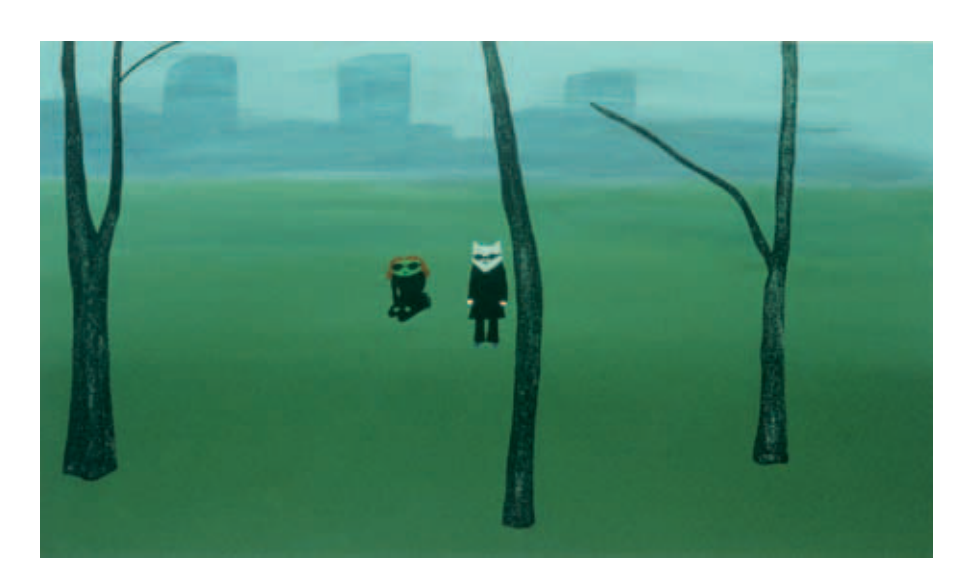
Vicky Park 1997 / Acrylic on Canvas / 54 X 95 cm

One of the most notable aspects of Arnold's painting is their predilection for a colour palette of saturated, luminescent colour. These