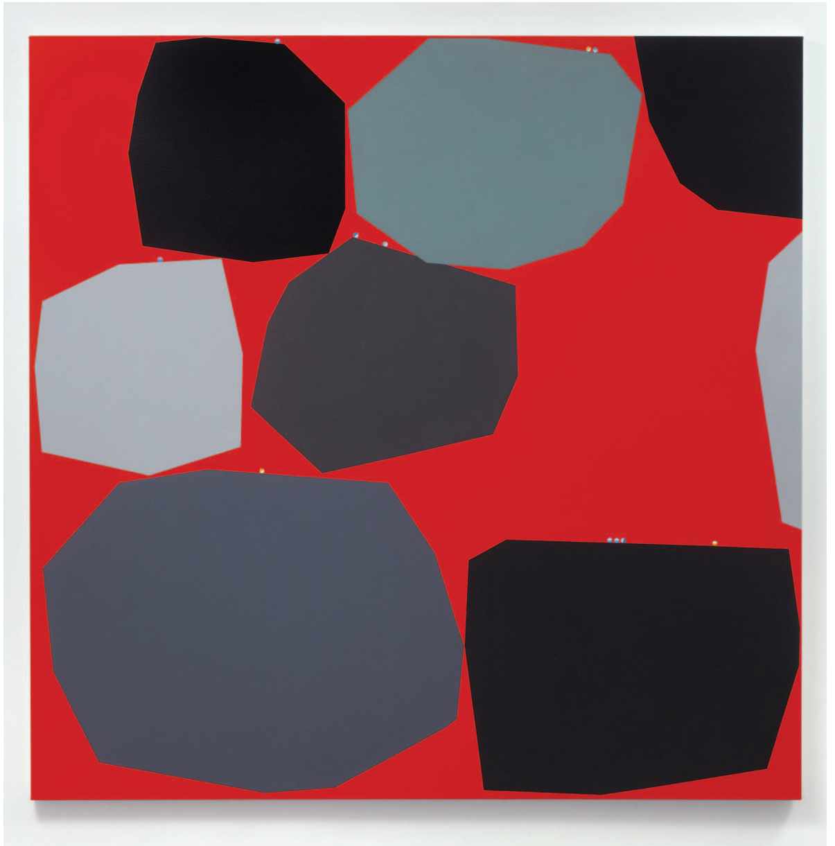
Over and Above, 2014